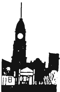
The Crow Collection

Crow Collection Association Urban Studies Unit Victoria University of Technology (Footscray) PO Box 14428 MMC, Melbourne 3000 Phone: (03) 688 4754, Fax: (03) 688 4805