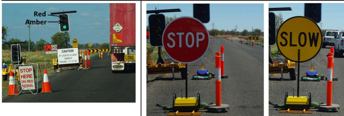
Solid Red - Amber - Green light (RAG)