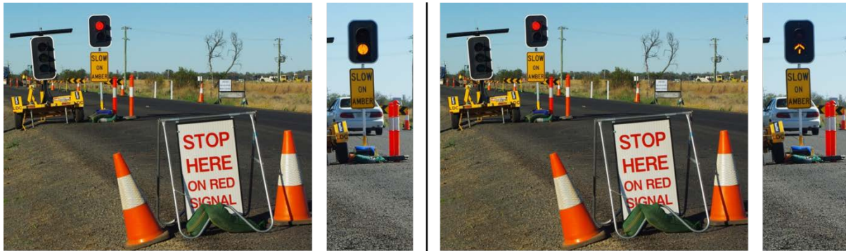
Solid Red - Amber light (RA)