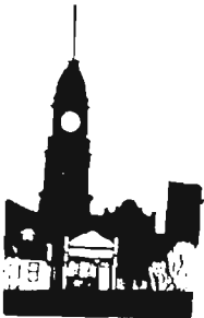
The Crow Collection

Crow Collection Association Urban Studies Unit Victoria University of Technology (Footscray) PO Box 14428 MMC, Melbourne 3000 Phone: (03) 688 4754, Fax: (03) 688 4805