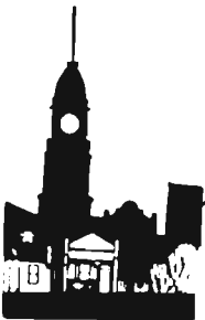
The Crow Collection

A Crow Collection Association has been formed and incorporated. One of its aims is to enhance the comprehensiveness and accessibility of the Collection through Living Library Projects.