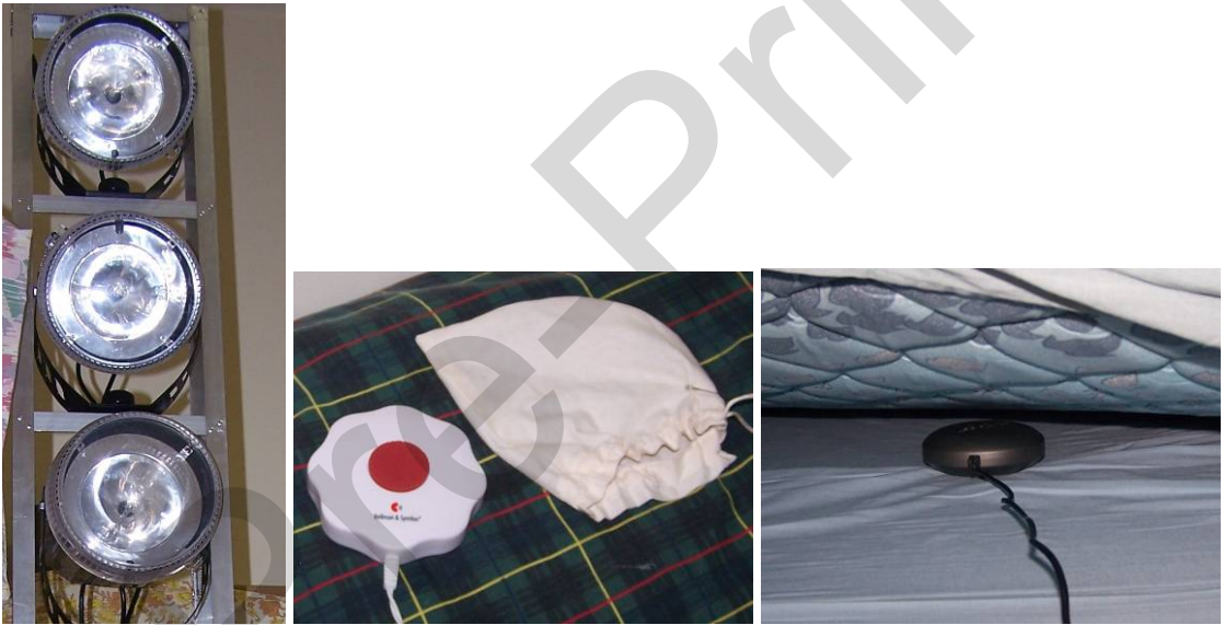
Fig. 1. The strobe lights and the pillow and bed shakers.

Data was collected by the sleep technician. In the overall study six signals were tested across two nights (three signals per night as far as possible). Three of the signals were auditory, only two of which are relevant to this paper. Signals were presented in a counterbalanced order and testing nights were usually a week apart. All equipment was set up on both occasions to minimize priming effects. Electrodes were attached according to the standard placement set down by Rechtschaffen and Kales [14]. For the alcohol impaired research alcohol was administered before and during electrode application.