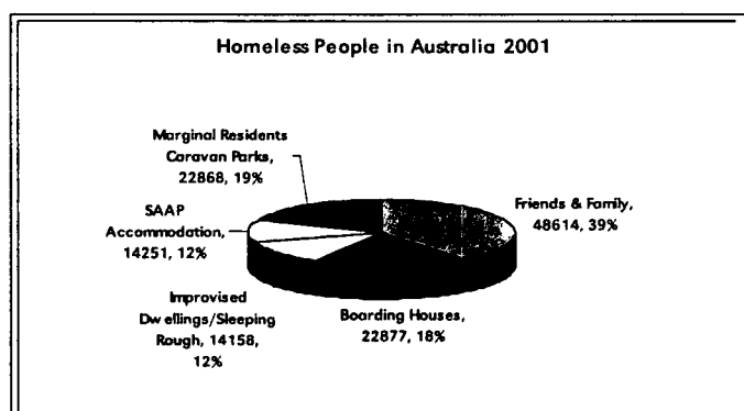
Figure 1: Australia's homeless population census night 2001

Source: Chamberlain and MacKenzie (2003:2), modified to include caravan parks