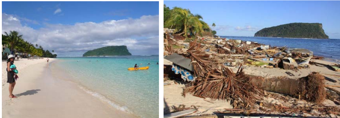
Figure 2: Lalomanu before (left) and after (right) the tsunami on 29 September 2009

While earthquakes and tsunamis are not related to climate change, disaster management is. Parts of this paper, therefore, refer to the tsunami and the related policy environment.