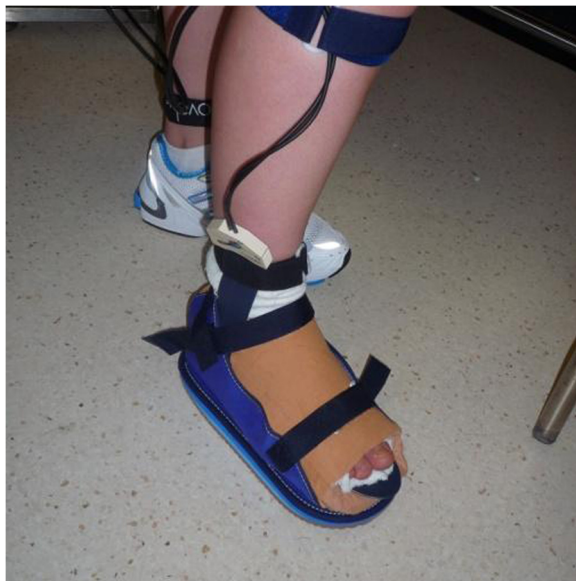
Figure 2 The shoe-cast condition. Cast walls were removed from the TCC leaving a well moulded shoe-cast condition.