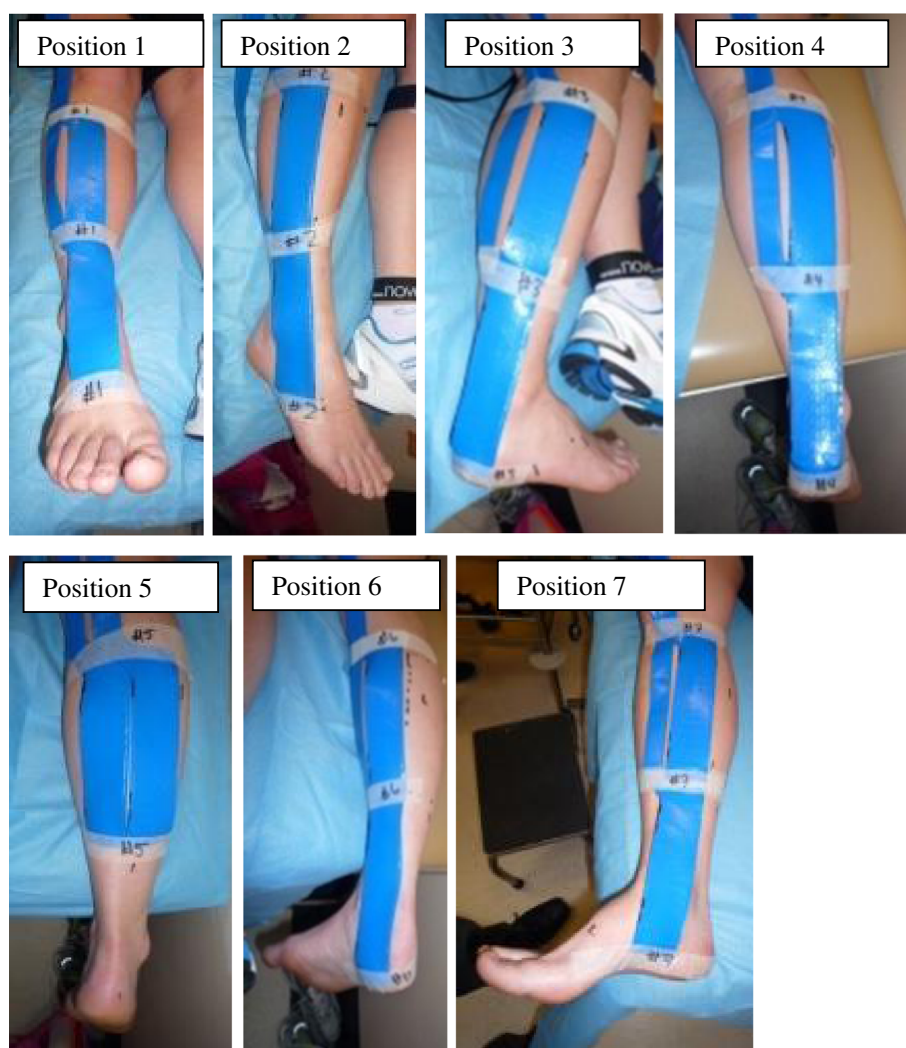
Figure 1 Orientation of sensors used to measure cast wall pressures at the seven different locations.

and cast wall data. The data from seven locations of the cast wall were synchronised for comparison at the same temporal events.