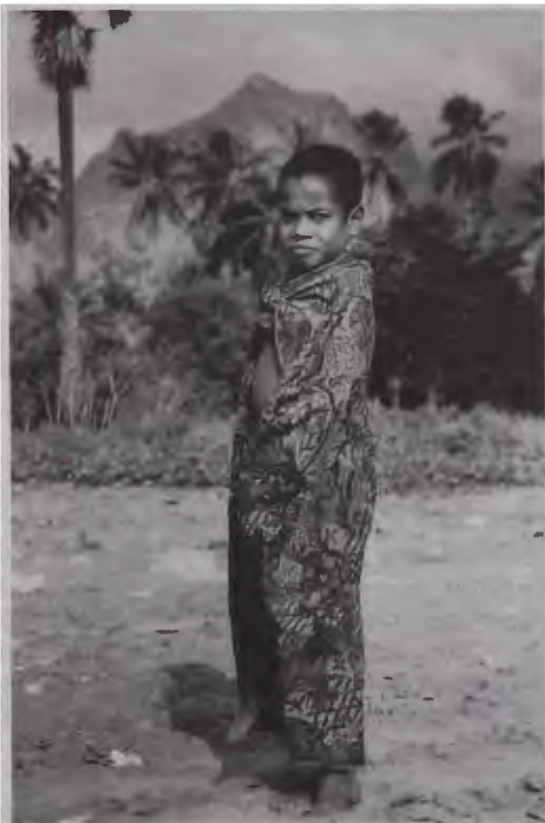
What future for East Timor?

Timor Link also analyses the longer-term international implications of the Santa Cruz massacre and looks at the current efforts of some Western governments to pressure Portugal, the former colonial ruler and current president of the European Community, to temper its demands for East Timor's self-determination. At the recent session of the United Nations Commission on Human Rights, an EC-backed resolution was blocked.