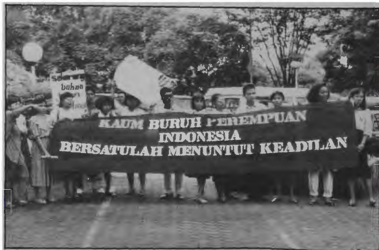
The banner reads: "Women Workers of Indonesia, Unite to Demand Justice".

The Jakarta Labour Office recorded 138 strikes in the capital, as compared to 64 strikes in 1993. The Surabaya Legal Aid Institute recorded 314 labour disputes in the city in 1994 as compared to 153 the previous year. Figures from the government-sponsored union, the SPSI, are even more spectacular. Chair of the union Imam Sudarwo, said in December that there were 1,130 strikes nation-wide in 1994 as compared with 312 strikes in 1993, an increase of 350%. This means that there were no fewer than three strikes a day. West Java holds the record with 581 strikes, followed by East Java with 200, Jakarta with 146, North Sumatra with 140, Central Java with 54, Riau with 5, West Kalimantan 3 and one strike in South Sumatra.