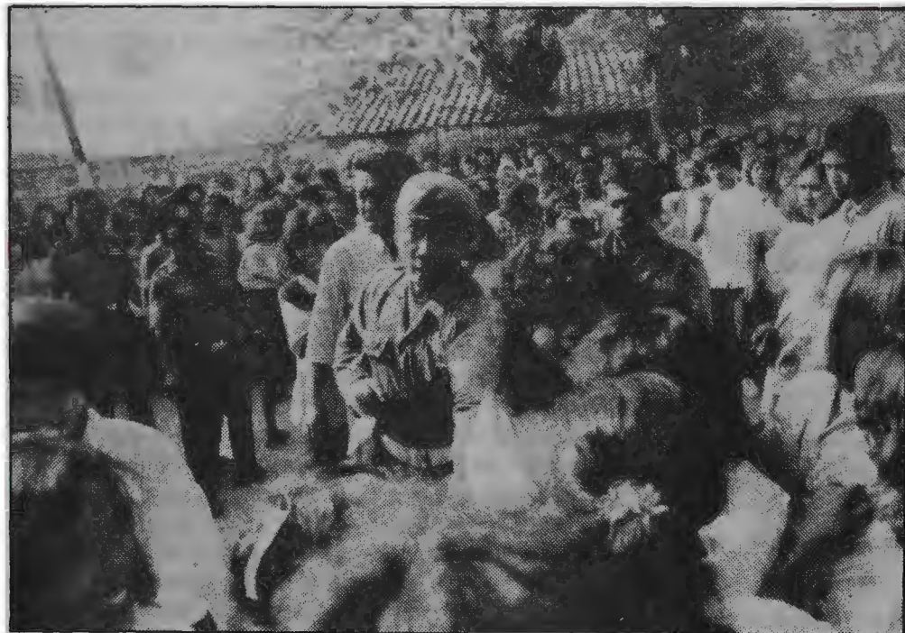
Security officers against striking workers. In labour conflicts the military always intervene, only increasing tensions.

Also in Tangerang, more than 2,500 workers at PT Sarkis Pacific Indonesia (SPI) went on strike on 12 December for the right to set up a union. Carrying banners, the workers