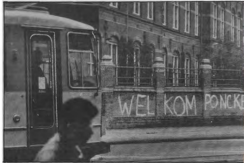
Amsterdam graffiti welcoming Poncke Princen

On 27 December 1949, the US dragged the two warring parties to the negotiating table and forced the Dutch to hand over sovereignty to the Indonesians. Poncke Princen was ahead of his time, fired by a healthy political intuition to side with the Indonesians. The 17 August proclamation of inde-