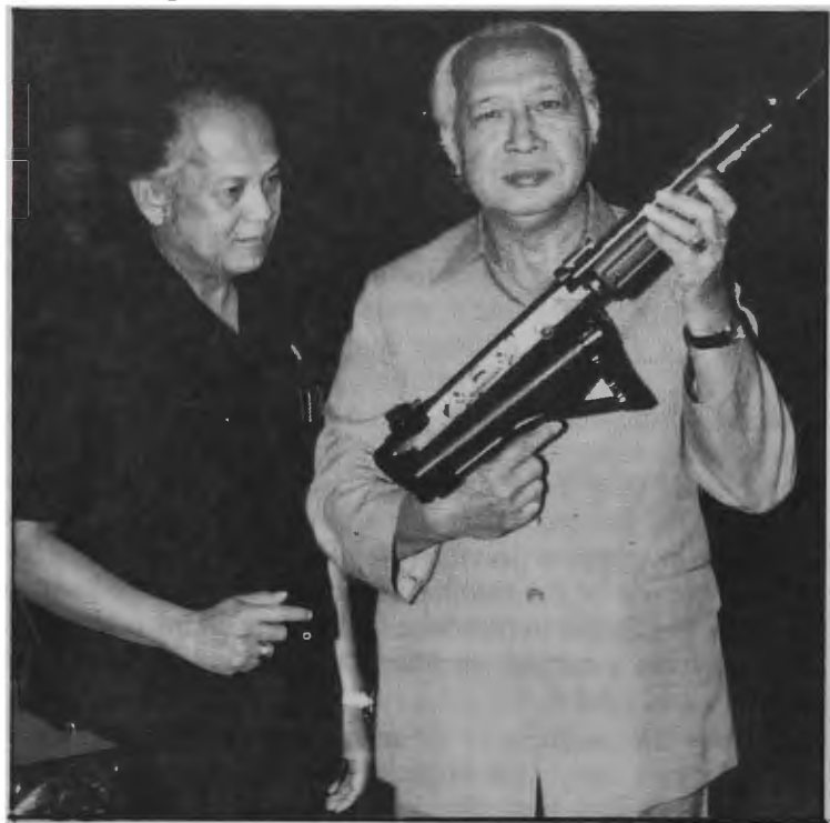
Suharto and Habibie share the same concepts

To put it bluntly, tired of fighting the system, they opted to join it, in other words, translating clientelism through Habibie into more political power, as has already happened. In the political game of who is using who, thirty years' rule has made Suharto a past-master. It has become clear that Suharto distrusts 'the real ICMI ' and will never allow them to become too powerful.