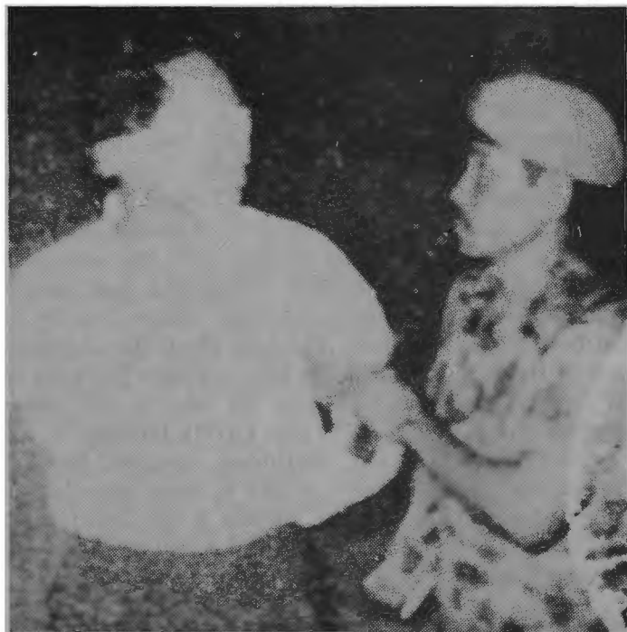
D. N. Aidit just before his execution

Four of the five top leaders of the Indonesian Communist Party (PKI) disappeared after being taken into custody. The fifth, Sudisman, was the only one to be brought to trial in 1966. He received the death penalty and was executed in 1967. D. N. Aidit , Chairman of the PKI's Central Committee, was arrested in a village near Solo, Central Java in November 1965. From there, it is reported that he was driven away in an armoured vehicle which drove in the direction of the Merapi-Merbabu mountain complex. While