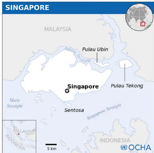
Figure 1: Location of Singapore.

Singapore (Figure 1) began conceptualizing potable reuse in the 1970's to deal with the challenges of population growth, break dependency on Malayan supplies , and to supplement their existing reservoirs [1] . However, due to the lack of suitable technology and the high costs associated with the processes at the time, the idea was not pursued.