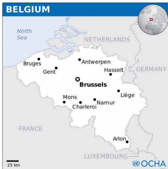
Figure 1: Location of Torreele/St-André water reclamation plant, Veurne, Belgium.

Further information on the Torreele/St-André water reclamation plant can be found on the Global Connections Map on the Water360 website.