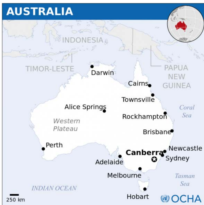
Figure 1: The Western Corridor Recycled Water Scheme is located at Brisbane, Queensland, Aust.

Although the purified water was intended for surface water recharge of the Wivenhoe Dam when the combined levels of potable supply fell below 40%, to date, this has not happened. The purified water was only ever supplied to industrial customers (2010-2013) before the plant was decommissioned in 2013. Despite its short lifespan, the scheme has been awarded 13 state, national and international awards.