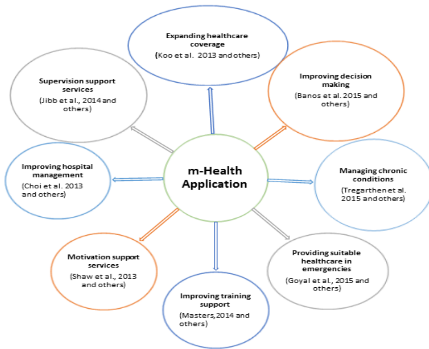
Figure 2: Eight emerging themes (innovation areas) of M-health research