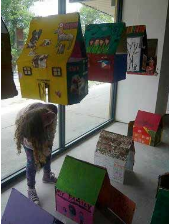
Figure 3: One Thousand Boxes