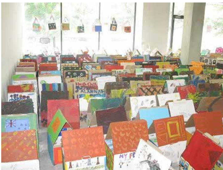
Figure 4: One Thousand Box neighbourhood