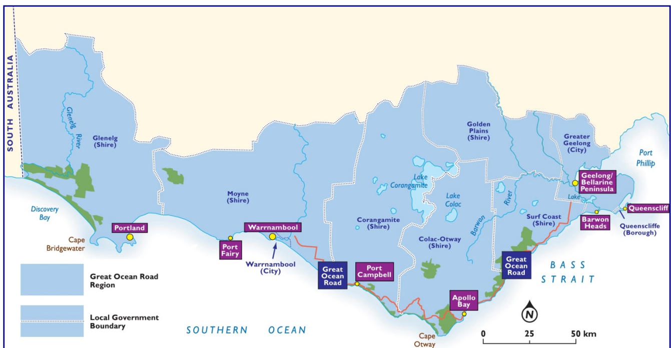
(GOT Map)

rainforest and hinterland, and features the striking 12 Apostles, a collection of limestone stacks that run along the 70 metre-high cliffs of Port Campbell National Park (Great Ocean Road Australia, 2009a). The Great Ocean Road also forms part of the Great Southern Touring Route that includes the vineyards of the Bellarine Peninsula, the old fishing village of Port Fairy, the Grampians National Park to Halls Gap and the historic Goldfields region of Ballarat (DIIRD, 2006). Whilst the GOR is most famous for its natural splendour, it also has cultural and historical significance; it is the world's biggest war memorial. The road was built after World War I by returned servicemen as a permanent memorial to honour those that died during the Great War of 1914 – 1918 (Tourism Victoria, 2009a).