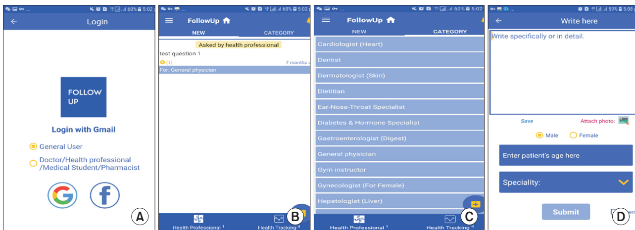
Figure 3. Some specific screenshots of the proposed solution: (A) login navigation, (B) home page with health tracking navigation, (C) selection of specializing or specific area, and (D) requirement submission.

As seen in Figure 2, the proposed CDS solution utilised a back-end system for communication through a cloud-based web server for data processing and data storage. The emergence of cloud computing enables an affordable, configurable, and scalable information service platform that offers better e-Health solutions and possible connectivity, for example, by linking medical information and practitioners who are geographically located in different places as well as enabling online communication about medical issues, diagnosis, and treatment [30-32]. Cloud computing goes beyond the traditional ICT service model by providing online