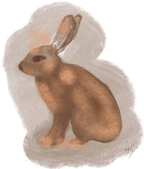
Fig. 1 The Manifesto and multimodality