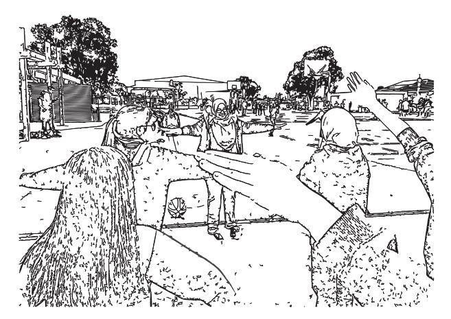
Figure 9.3 Artefact 3: Doing intercultural professional work.

There is a mix of cultures at the school, but the teachers (myself included) are predominantly Caucasian. The diversity of the PST group takes learning beyond the intended curriculum plans for PE sessions for the 5/6 students and the adult observers! (Gloria's journal reflections about the moment in time represented in Figure 9.3)