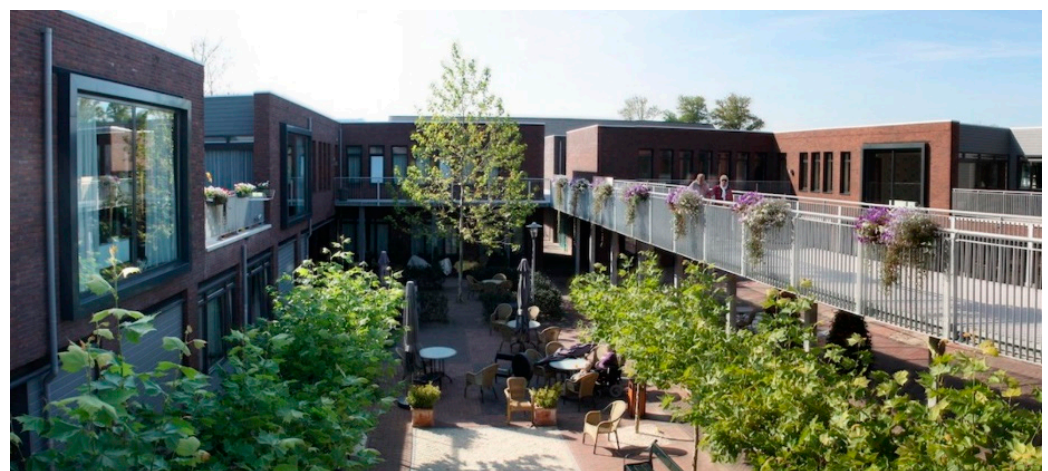
Figure 6. Courtyard and outdoor seating of De Hogeweyk, The Netherlands (adapted from WAR 2020 [113]).

Each household is configured around courtyard spaces, and each of them has distinctive features to form key landmarks for wayfinding and orientation. All households are accessible to outdoor spaces to maintain a connection with external environments (Figure 6). Generous outdoor spaces with gardens, water features, alleyways, and streets allow residents to wander and explore in a stimulating manner [83]. The objective is to maximise residents' autonomy, encourage social interactions, and foster community engagement [112].