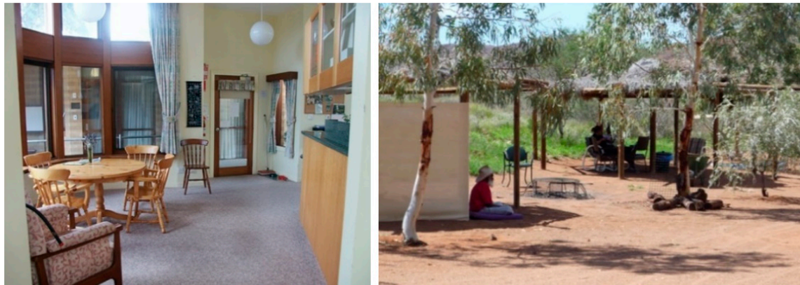
Figure 2. Homelike environments in different settings, adapted from the WAR Volume 2 ((left), [59] and (right) [60]).

Figure 2 shows how the schema can work in practice. Here are two examples of places to sit: one inside (left [59]) and one outside (right [60]). In both cases, the goal is to provide equality in opportunity, dignity, autonomy, choice, and independence. One of the principles that needs to be applied to achieve these goals is to ‘Create a familiar place’. An approach that responds to this principle is to create a homelike environment. In this example, it is the design responses that are very different, as they consider people’s specific contexts and cultures. As a result, in one setting, people sit indoors at a table or in an easy chair looking out of the window, whilst in another setting, people sit outdoors on ground with good sand located under a structure with shade.