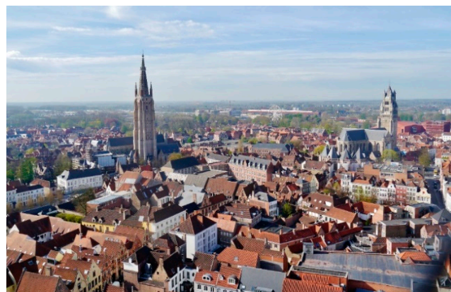
Figure 3. Bruges, Belgium (adapted from [88]).

Various initiatives have been implemented in Bruges under the coordination of Foton. More than 90 shops display a logo of a knotted red handkerchief to signify that the staff have a high level of awareness about dementia and can provide compassionate assistance to those in need [86]. The Foton choir, composed of members living with dementia, has been actively participating at the Bruges' Music for Life Festival through live performances. A database has been set up to identify residents who are prone to wandering and to provide necessary assistance with wayfinding and navigation for those in need [87].