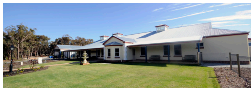
Figure 5. Domestic style and scale of Hawthorn House (adapted from WAR 2020 [108]).

In addition to the kitchen, both dining and living areas are domestic in scale, with homely lighting, furniture, and interior design. Small-scale lounges are provided for enjoying solitude and engaging in social interactions with others, subject to their own choices (Figure 5). Visits from intergenerational community groups offer opportunities for household members to connect with others, including a mother and baby playgroup, a community choir, and a group of retired farmers [106]. Household members are encouraged to spend time in gardens with clear wayfinding paths, a men's shed, and raised vegetable planting beds for outdoor activities. They can also interact with animals by cleaning out the canaries cage, feeding the chickens, collecting the eggs, and walking and bathing the dog, allowing them to enjoy loving companionship with animals [107]. The care environment is designed and operated with a clear focus on wellbeing, enablement, and therapeutic benefits for people living with dementia.