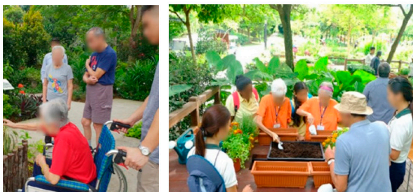
Figure 4. Therapeutic garden at HortPark, Singapore (adapted from WAR 2020 [92]).

The activity zone has exercise equipment and provides space for conducting therapeutic programmes and horticultural activities (Figure 4). Moveable and raised planter beds with easily accessible water sources facilitate wheelchair users and people living with dementia to participate in typical garden tasks, such as watering, weeding, and harvesting [91].