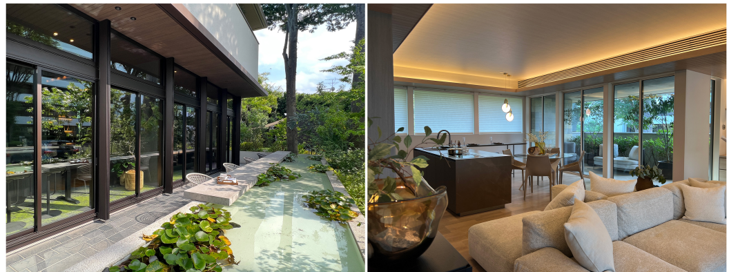
Figure 6. Exterior and interior of a display home of Misawa Homes.

from scratch and to have better control of the budget [66]. Although Misawa Homes only offers prefabricated timber houses, various house designs are available for customers to select, ranging from affordable MJ Wood series with post-and-beam construction [62,67] to prefabricated timber panel constructions of the Genius house series with 2.6 m high ceilings [68] and the Century house series [69], in which the recent model of Century with Storage ZEH Advance House has up to a 3.3 m high ceiling [70]. Prefabricated single-family houses are offered in single-storey, double-storey, and three-storey versions depending on the customers' budget and requirements.