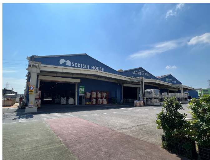
Figure 5. Eco First Park of Sekisui House with recycling facilities.

Sekisui House is a pioneer in recycling 100% of building waste at 23 Resources Recycling Centres across Japan, including the Resource Wellspring Resource Recycling Centre in the Eco First Park [41] (Figure 5). Waste measurement systems are used at new construction sites for accurate tracking of the amount of waste generated with IC tags for traceability before sorting it into 27 categories. The waste collected from construction sites is further separated into 80 sub-categories at the Resources Recycling Centres for recycling either in-house or by contractors [55]. Through waste recycling, Sekisui House has developed its own recycled products, such as Platama Powder, an athletic field marking chalk [48].