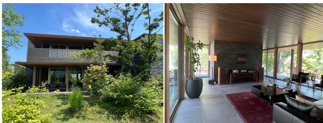
Figure 3. Exterior and interior of a display home of Sekisui House.

Sekisui House set up the Home Amenities Experience Studio (Nattoku Kobe Studio) to enable customers to gain their first-hand experience of various house settings and component performance before making their personal decisions for design customisation [47]. Moreover, there are five Tomorrow’s Life Museums across Japan (Kansai, Kanto, Tohoku, Shizuoka, and Yamaguchi) with experienced-based facilities and display homes for the general public to visit (Figures 3 and 4). “Everyone’s House! Houses of the Future!” classes are organised to encourage students to learn how to design their own house of the future [48]. Sekisui House also organises Home Visit Days for customers to visit their completed houses and engage with homeowners to have a better understanding of the design customisation process from a user’s perspective [41]. Similar to Daiwa House, Sekisui House offers single-family house design in timber (one to three-storey Shawood) [49], light-gauge steel frames with one to two storeys in height, and heavy-gauge steel-girder rigid frames with three to four storeys in height [50,51].