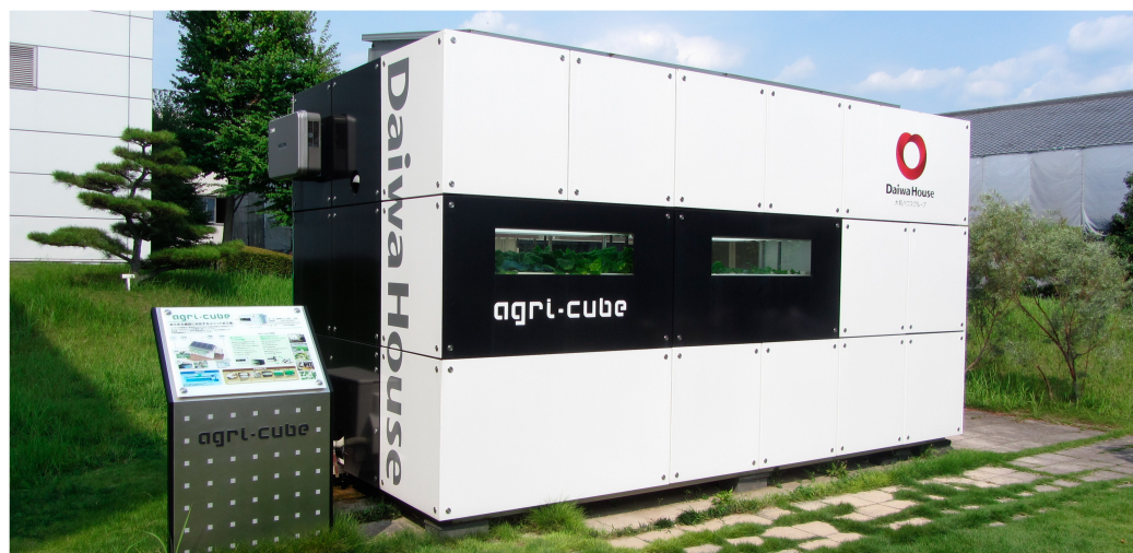
Figure 2. Daiwa House’s research of agri-cubes for hydroponic planting.