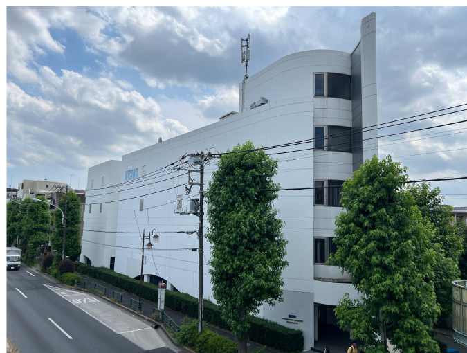
Figure 7. Misawa Homes Institute of Research and Development in Tokyo.

The Misawa Homes Institute of Research and Development (MHIRD) was established in 1973, which was one of the first think tanks in the Japanese housing industry for pursuing innovations and advancing future lifestyles through technical development [71] (Figure 7). The MHIRD has been actively engaging with higher education organisations for research collaborations. For example, the MHIRD engaged with the Okinawa Institute of Science and Technology Graduate University (OIST) in 2016 for setting up an experimental eco-friendly house in Okinawa for promoting sustainable living and improving the quality of life in hot and humid areas [72].