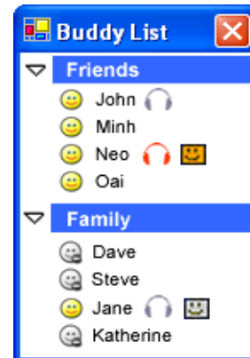
Figure 4. Buddy List