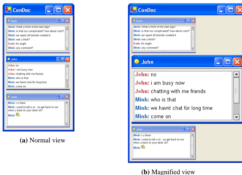
Figure 1. Conversation Dock (ConDoc)

As discussed in Section 3.2.1, the participants reported that current support for awareness of multiple conversations in IM is limited and insufficient. Conversation Dock (ConDoc) was designed to assist users in managing their multiple conversations. ConDoc helps users to manage their conversations by placing all currently active conversations in a miniature window form (Figure 1a). Users can quickly read a conversation in ConDoc by moving a mouse over it. As a user moves the mouse over a particular conversation, the window of that conversation is enlarged while windows of other conversations in ConDoc remain unchanged (Figure 1b). This creates a visual effect of magnification lenses described in (Greenberg et al., 1996; Bier et al., 1994). If users want to type further in a particular conversation, they can drag the conversation out of ConDoc and interact with the window as normal. When users minimise a chat window, the window is then put back into ConDoc instead of being placed on the task bar.