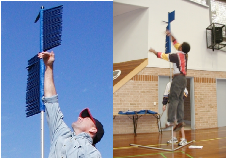
Figure 1a and b: Yardstick Demonstration

Jump and reach heights were measured using a Yardstick (SWIFT Performance Equipment, Lismore, NSW) (see Figures 1a and b).